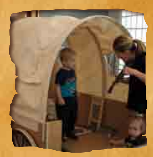
EXPLORE: Pack the covered wagon for the trip west.

Enjoy exploring colonial shops, a pioneer covered wagon and more!