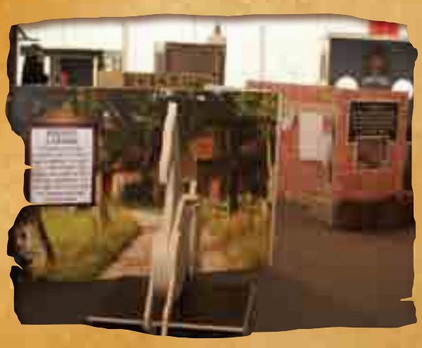
PRETEND: Ride a horse.