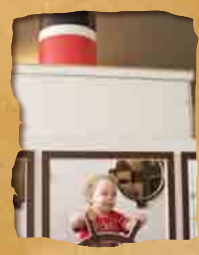
PLAY: Steer the boat.