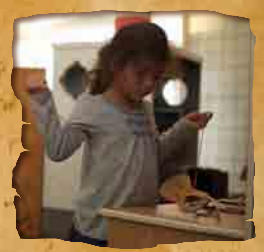
WORK: Pretend to work in a blacksmith, carpenter, printer, and shoemaker's shop.