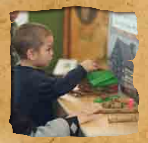
BUILD: Construct a log cabin home.