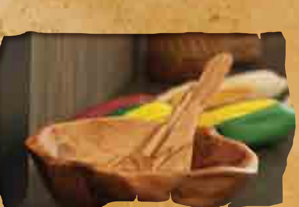
IMAGINE: Prepare food in the Longhouse.