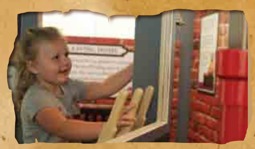
LEARN: Be a train conductor or ride as a passenger.