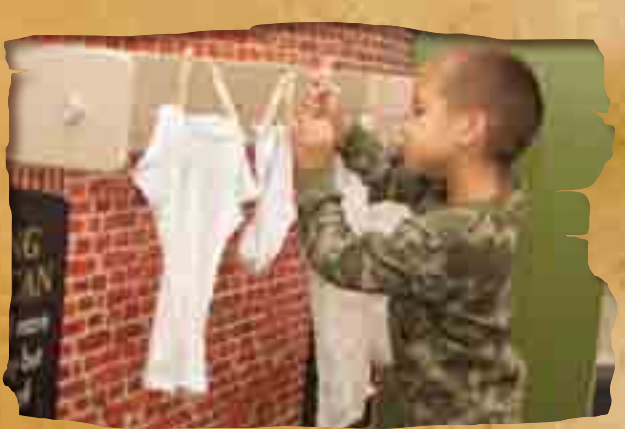
ACT: Hang clothes to dry.